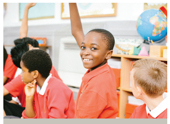
Children served by an Impetus-PEF grantee

For all the rigor and transparency of Impetus-PEF's approach, it was hard for the foundation to make the case that its approach was actually working. As Paulson put it, "Until last year, we were essentially saying, 'I have an amazing recipe. I'm telling you it's going to taste good because we know what we're doing."" Now, however, Impetus-PEF has assembled compelling evidence that its approach is, in fact, helping grantees improve their